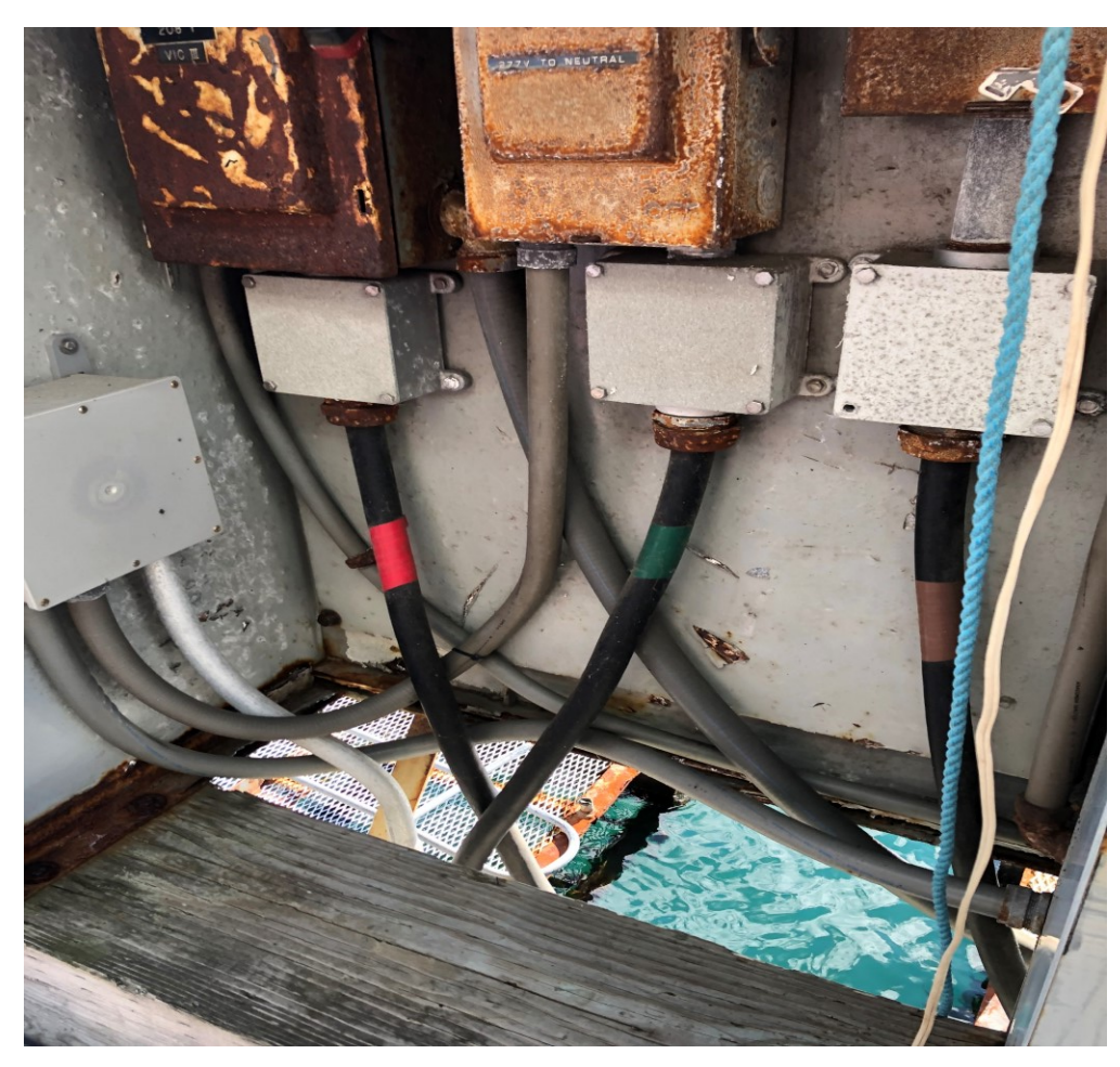
Corroded Electrical Equipment