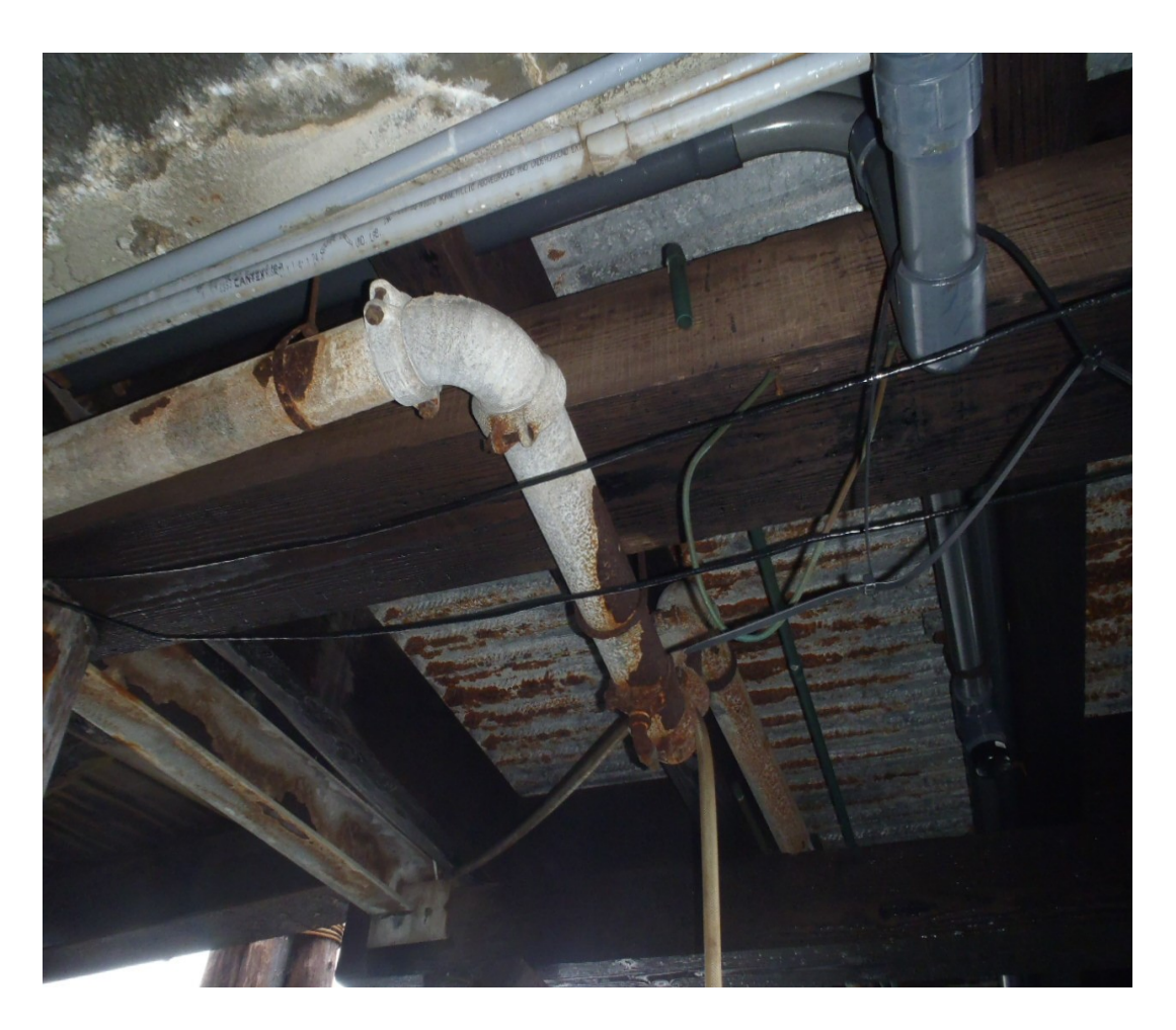
Galvanized Water Main