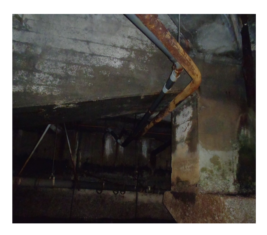
Subject to Tides and Low Light Conditions