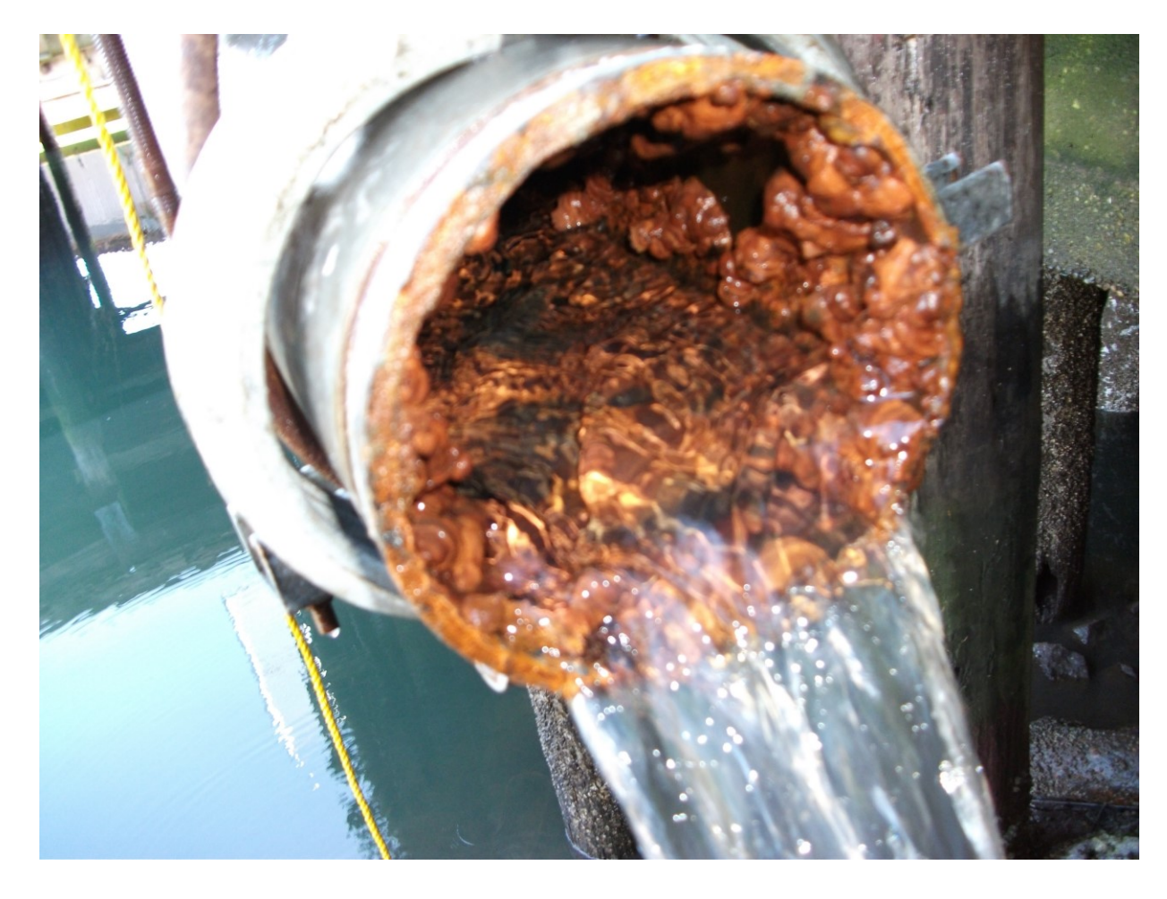
T91 Potable Water Pipe with Similar Age to P69 Pipe