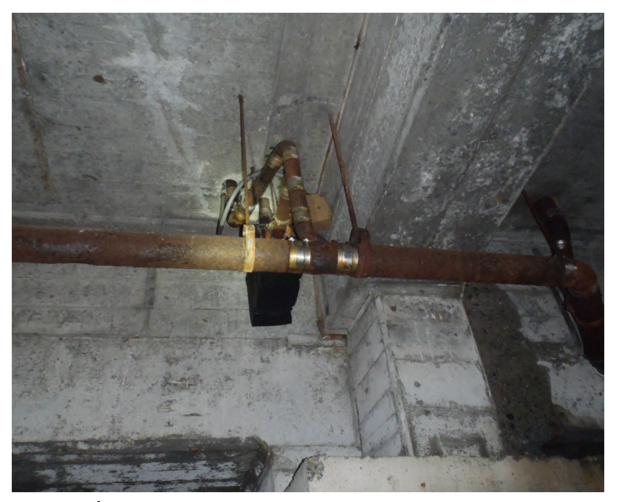
Corroded Sewer Lines and Hangers